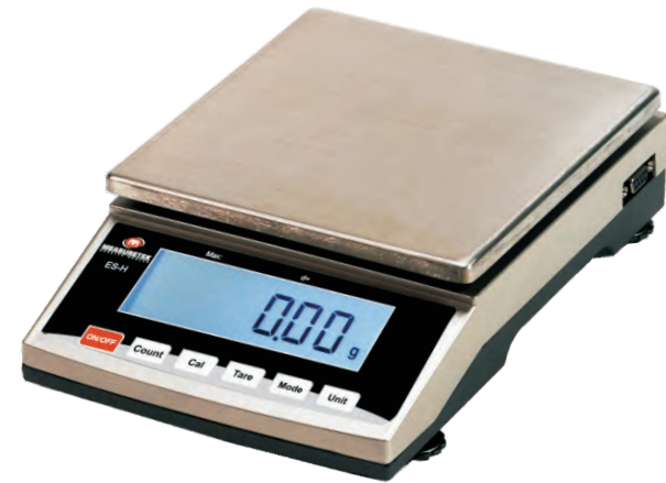
ES-H with Aluminum Base