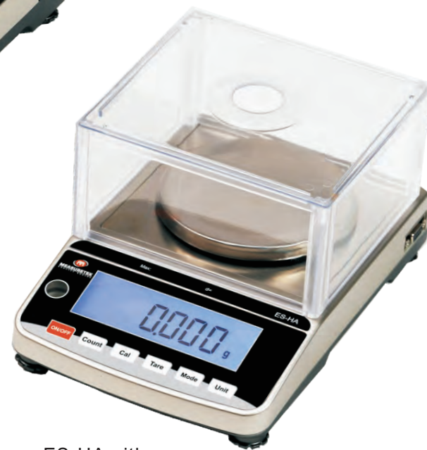
ES-HA with ABS Plastic Base